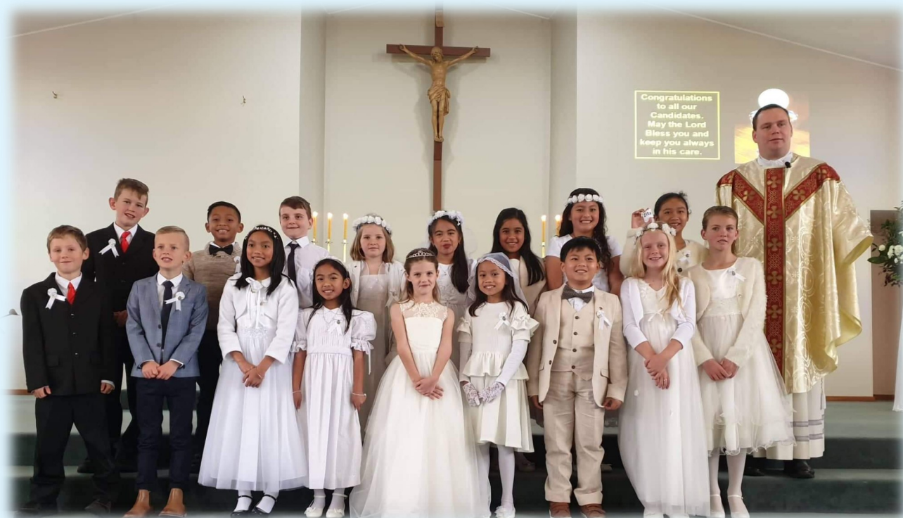
Congratulations to our students who received their First Holy Communion on Sunday