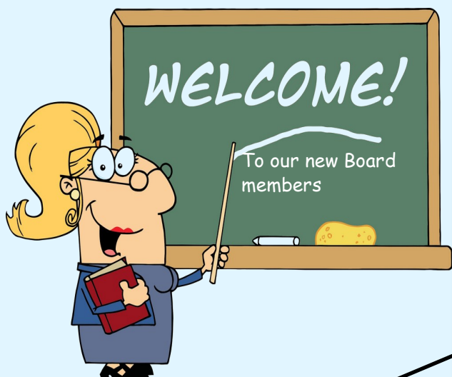
BOARD OF TRUSTEES