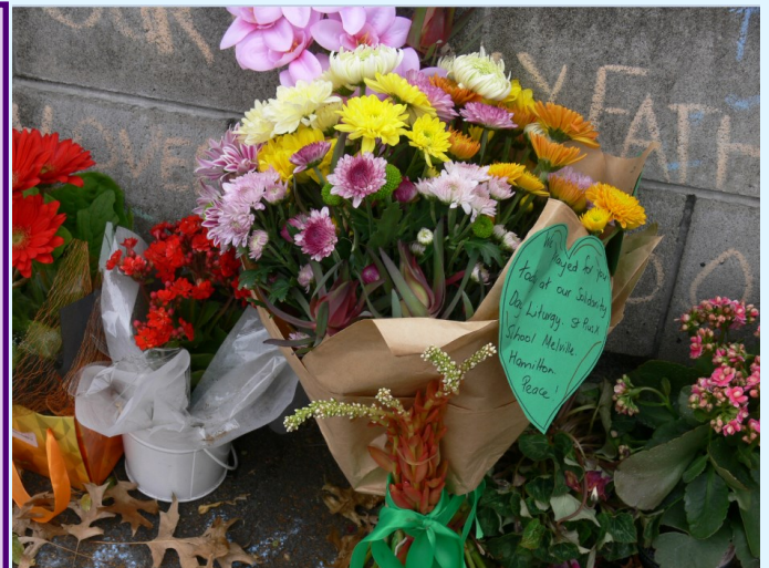
St Pius X flowers at the Hamilton Mosque

We ask this through our Lord Jesus Christ, Your Son