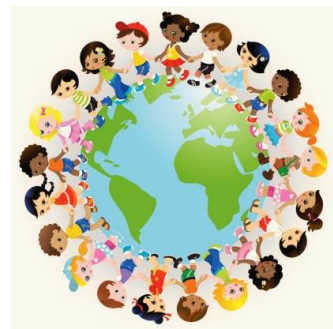
Hands Across the World