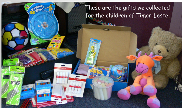
These are the gifts we collected for the children of Timor-Leste.